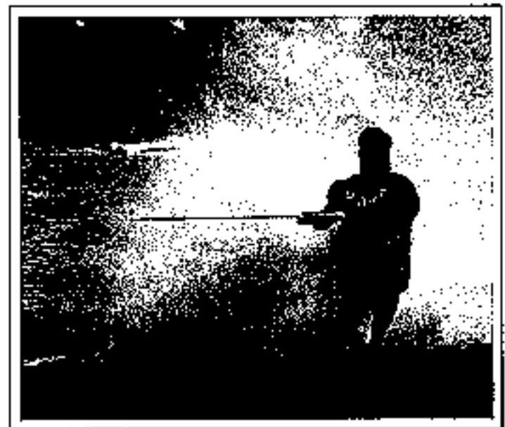
"No Face Plant For Me"