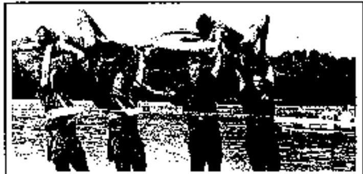
"Making it Look Easy"