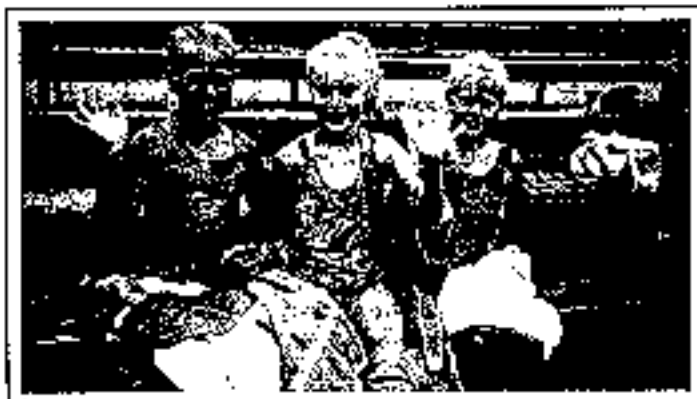
their guests to see.

July 23, 1994 was also the 4th annual Tomahawk Fly in. The Kwahamots provided assistance to the Friends of the Tomahawk Airport, in addition, to displaying our boats for