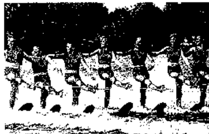
"Are Our Boyfriends Watching?"

Plans are already underway for the 1995 event, to again be held in conjunction with the Wisconsin State Show Tournament, July 14th, 15th, and 16th.