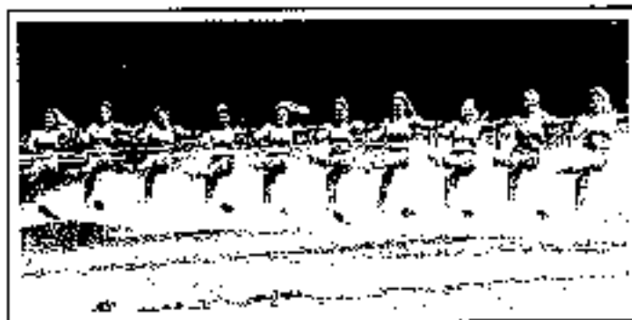
"Let's Line Up For Another Pass!"